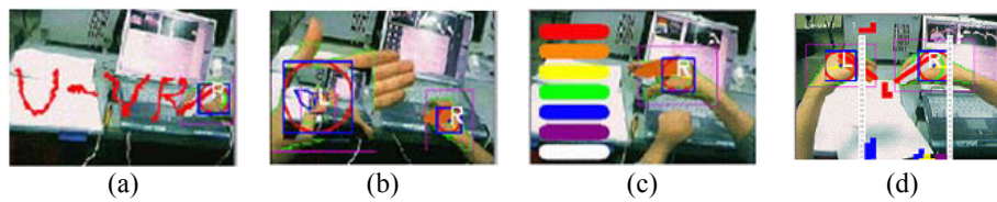
Fig. 2. (a) Memo by using a virtual pen (b) a saved image is augmented on the palm. (c) Change color of a pen (d) the user can move blocks using the finger tips in the Tetris game.