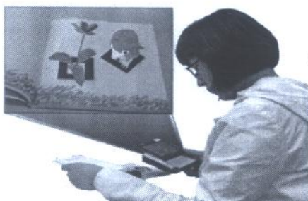
Figure 1 Augmented gardening system over a physical book.

We have implemented an augmented gardening system on Sony UMPC as a convenient mobile device with a digital camera. To detect physical markers and augment 3D models over the markers, we exploited OSGART combining Open Scene Graph and ARToolkit. We also used Cal3D, open source character animation library, for implementing character animation. Thus, users can easily see the virtual gardening system over physical markers through their mobile device. They also can experience the augmented system and interact with an animated bluebird in real space where they exist. The bluebird expresses the animated movement and displays the text as its verbal actions. Figure 1 shows the overview of the implemented augmented gardening system over a physical book.